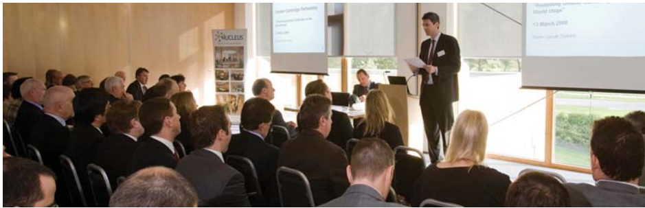
➤ ADDRESSING DELEGATES AT THE GCP BREAKFAST BRIEFING.

Chesterford Research Park played host to guests of the Greater Cambridge Partnership (GCP) as they launched a new initiative to promote Greater Cambridge on the world stage.