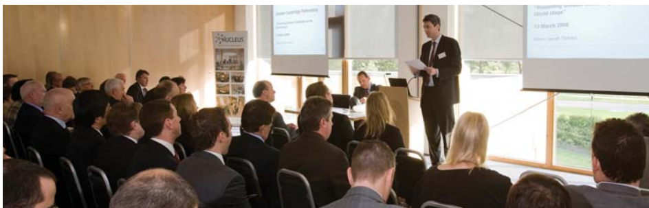
➤ ADDRESSING DELEGATES AT THE GCP BREAKFAST BRIEFING.

Chesterford Research Park played host to guests of the Greater Cambridge Partnership (GCP) as they launched a new initiative to promote Greater Cambridge on the world stage.